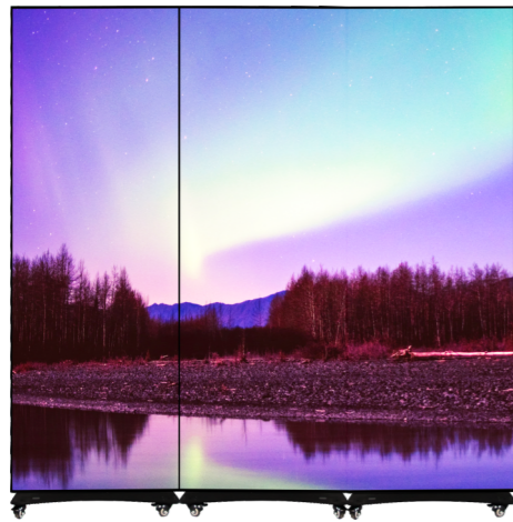
Screen splicing (Seamless splicing)