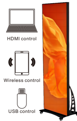
Multiple control modes